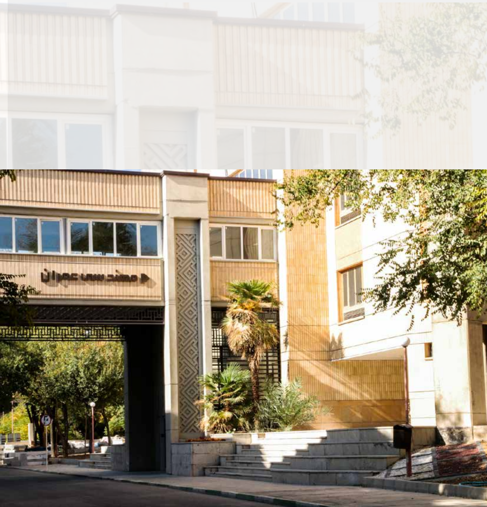
Department of Civil Engineering