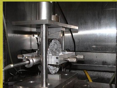
Indirect Tensile Test (IDT)

Marshall compaction hammer Marshall UTM device Dynamic tensile test Asphalt fatigue test Indirect tensile test Bending test Creep test Derivation of success modulus Indirect Tensile Test (IDT) Bitumen percentage determination test (Extraction) Asphalt fatigue test (fatigue beam test) Gyratory Compactor Los Angeles wear test California load ratio test